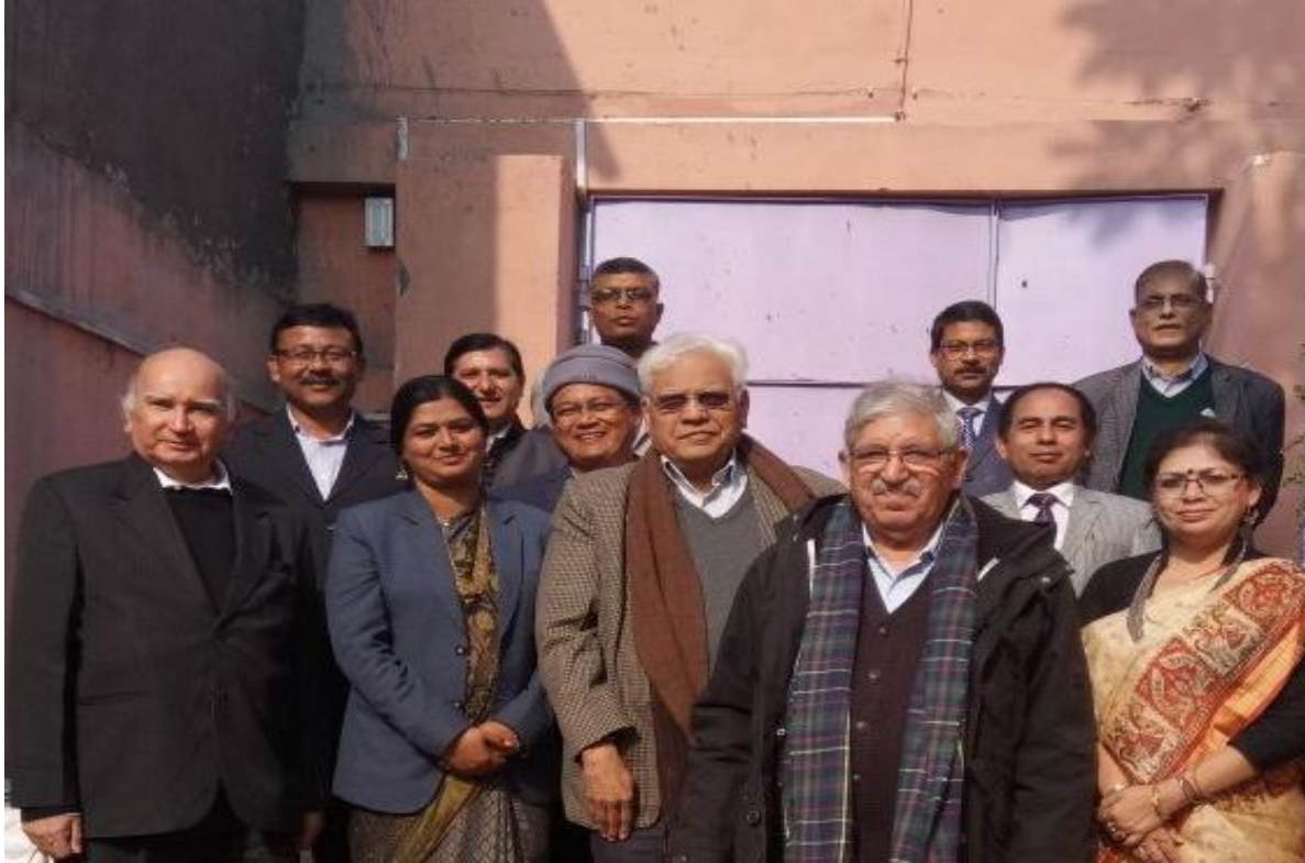
Group Photo of LDP Participants and Resource Persons in 3-day workshop on Managing Excellence and Innovations in Higher Education in emerging Fourth Industrial Revolution-28-30 December 2017