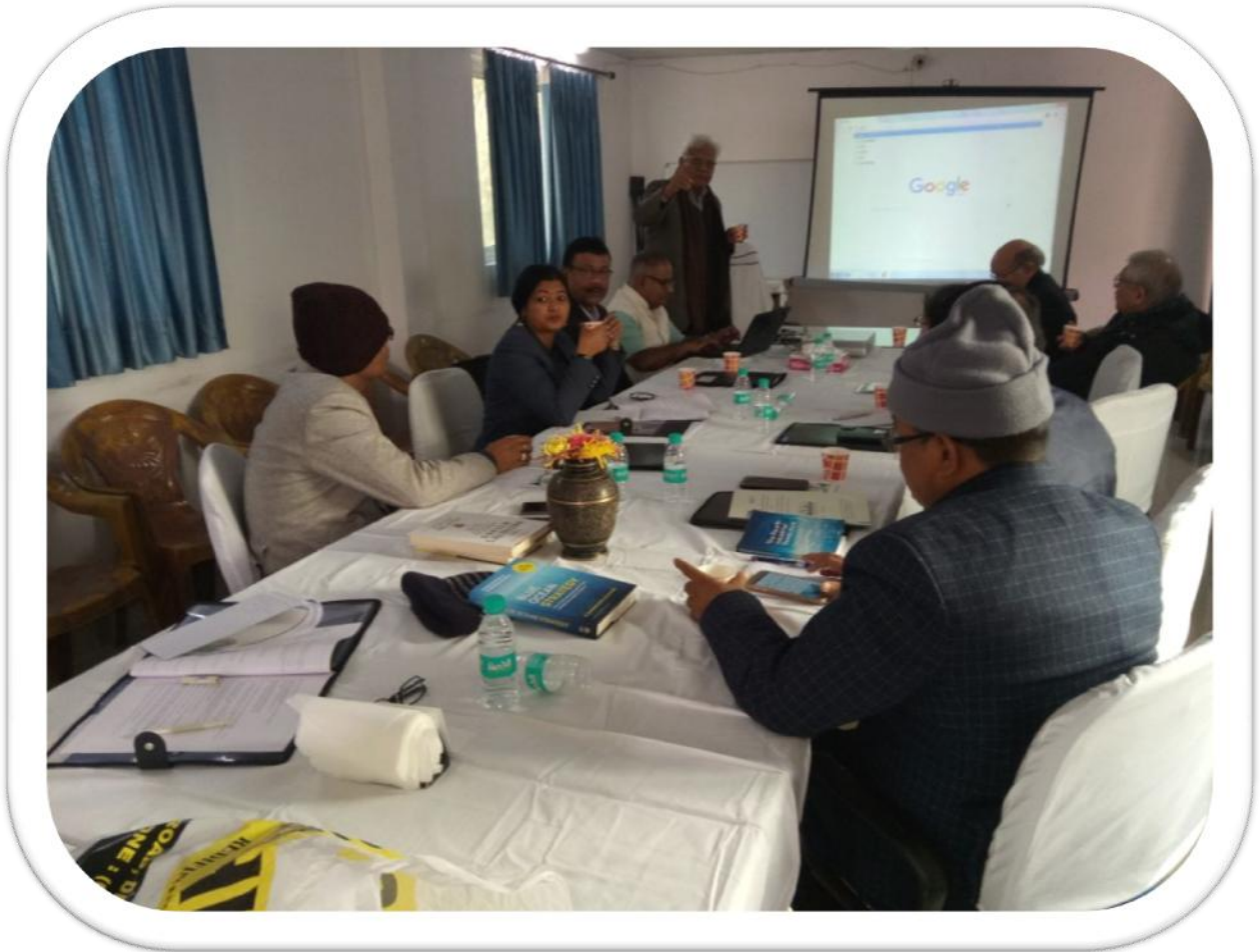
Participants and Resources Person interacting in the LDP Workshop on Leadership Development in managing excellence and innovations in higher education in emerging Fourth Industrial Revolution