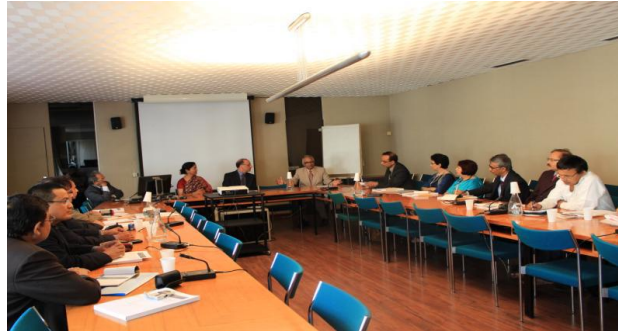
At IIEP, UNESCO, Paris