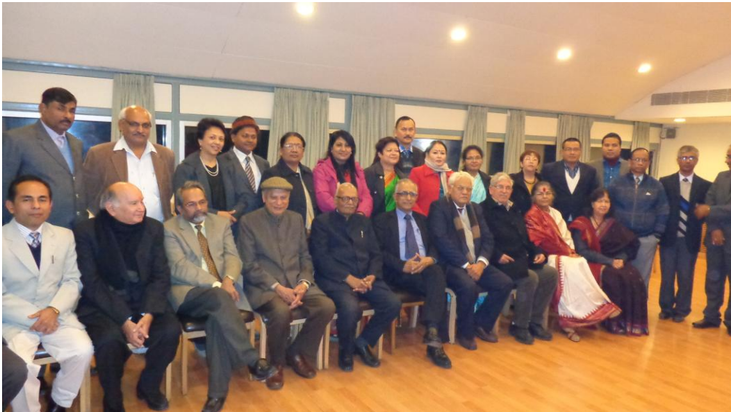
Award Ceremony Group Photo IDEL-HE First Batch at IIC, New Delhi