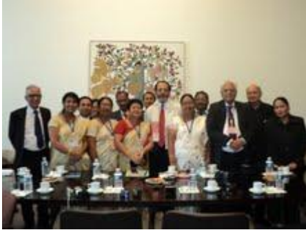
At Indian Embassy, Paris