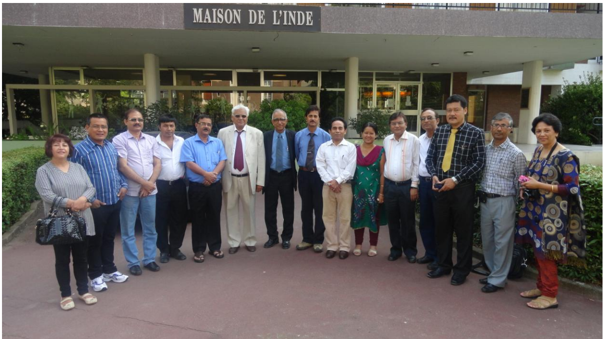
Participants and Resources Persons at India House, Paris