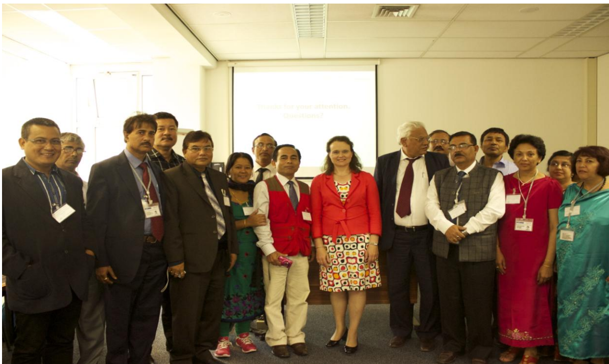
Participants and Resource Persons at Maastricht School of Management, Netherlands